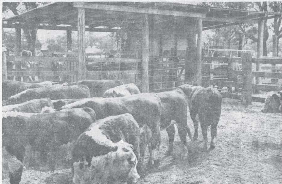
Some of the bulls under test (above) move in the new yard in front of the sheltered crush and scales.