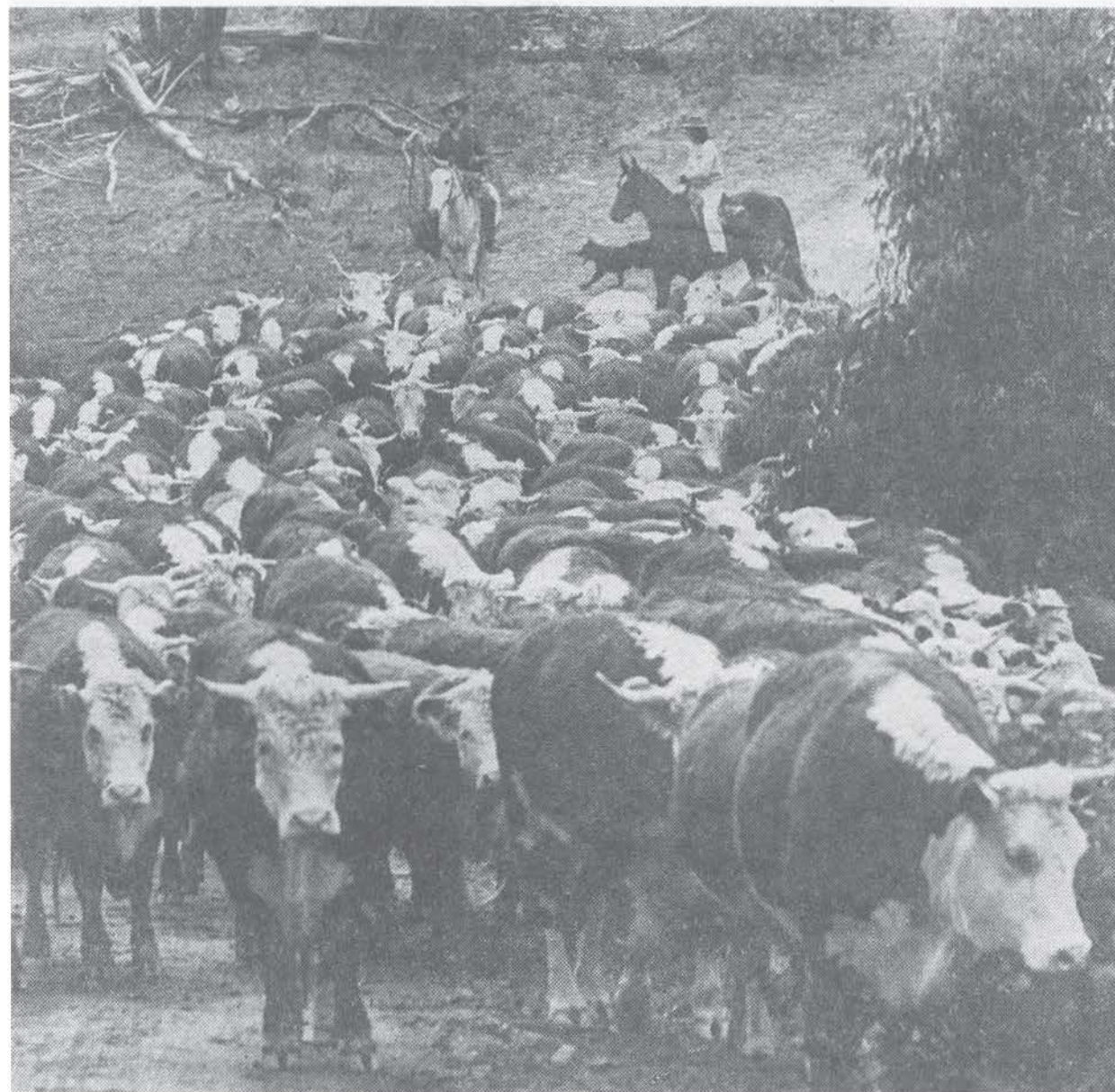
Cattle move down the trail as the round-up begins on the Dargo High Plains.

"Half the people are only young fellows looking for a place to take their girlfriends in the bushes and they can do that anywhere."