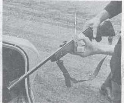
THE rifle that was confiscated during the search.

• Jeff's comment, P. 8 • Today's royal program, Page 26