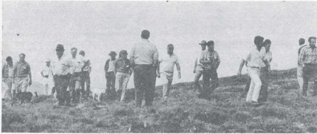
An inspection trip of the Mansfield Alpine grazing areas was held on February 8th and 9th. Thirty four people attended the two day trip and some of the party are pictured at left, walking back to their 4 wheel drive vehicles on Mt. Sterling after inspecting the eastern side of the mountain.

The party had come via No 3, Razorback and Clear Hills to Mt. Stirling and later travelled over the Bluff to Lovicks hut to camp the night. King Billy, Mt. Clear, Jamieson River and Sheepyard Flat were inspected next day before the party returned to Merrijig.