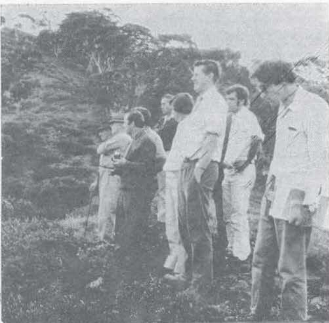
Section of the party looking over a 2000' cliff on King Billy in the headwaters of the Howqua River.